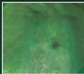
Oral Lesion Under Violet Light

Cordless DentLight Oral Exam Wand with interchangeable violet and white light heads, universal 2.5x flip-up loupes with fluorescence filters, charging stand, charge adapter, patient protective eyewear, and 100 Barrier Sleeves.